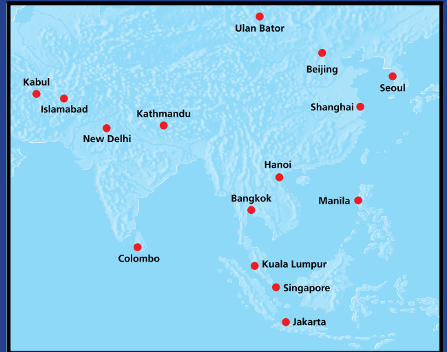
FES Offices in Asia